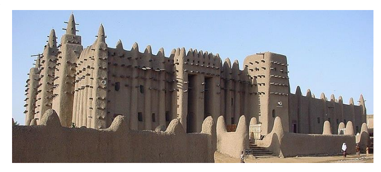
Fig 4. The Great Mosque of Cenne - Sudani-Saheli architectural style (www-3)

The Great Mosque of Cenne, given in Figure 4, has been standing since the 1300s. One of the greatest achievements of the Sudani-Saheli architectural style, this mosque is made of mud only. There are more than 100 columns in the mosque. The Grand Mosque of Cenne is repaired by the public every year on the Mud Festival. The mud collected by the children and young people from the river beds is carried with containers and carried to the masters who will plastering the walls. The ventilation of the adobe mosque is provided by the chimneys called 'Ladis' which are made of soil again.