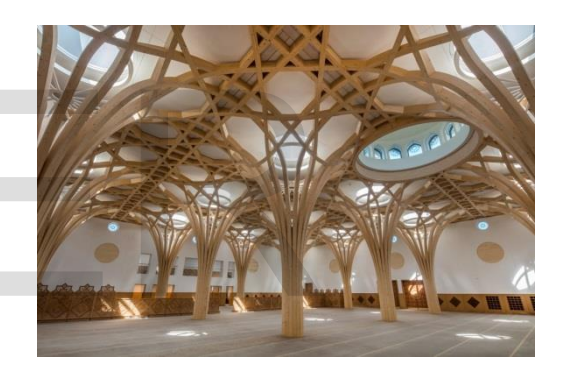
Fig 2. The Prayer Hall — Cambridge Central Mosque

The Cambridge Central Mosque appears to be an ordinary structure among the other buildings around it, and symbolizes humility as the basis of Islamic religion. For this reason, the mosque does not announce its presence very high in this environment, and welcomes the visitor gently through a series of nuanced and calibrated thresholds that begin with a lively but quiet garden on the side of the road. The structure bears a sense of tectonic and geometric rhythms that are echoed appropriately within the building, with complex yet robust, treelike spruce columns. It is possible to experience this feeling in the Nine Bridges Golf Club House 'designed by Shigeru Ban and Kaci architects" in South Korea, which is famous for its wood structure. Figure 3 shows the interior image of the building, taken by Shigeru Ban Architects. The similarity between Figure 3 and Figure 2 is remarkable. In this respect, it is felt that the load carrying system is not completely unique. For this reason, the building designed by Marks Barfield Architects is actually overshadowed by the claim to reflect and create a local Islamic architecture. The geometry of this building