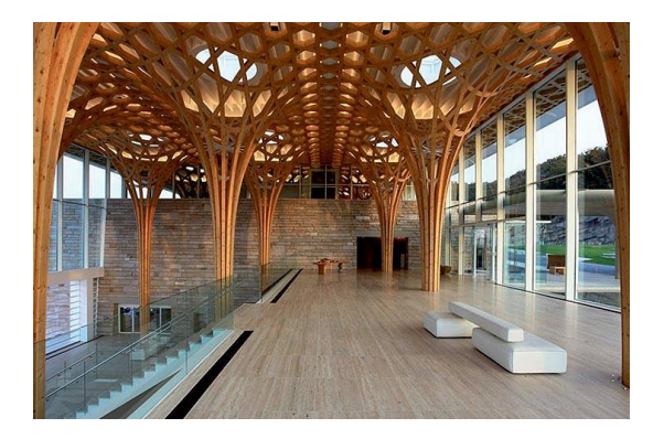
Fig 3. Interior of Nine Bridges Golf Club House (www-2)

(possibly the decisive detail of the building) is the 30 digitally produced tree pillars supporting the building's impressive hulking roof structure. The original columns are fabricated by Swiss timber construction (by Blumer Lehmann), the structural system have 145 different components and about 2700 individual components.